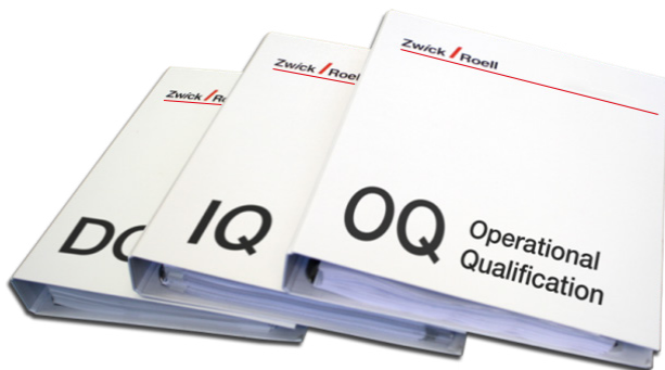
Bottom-up document structure

ZwickRoell has already performed over 1,500 successful qualifications—both nationally and internationally.