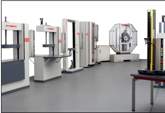
Our extensive selection of pre-owned testing machines and instruments